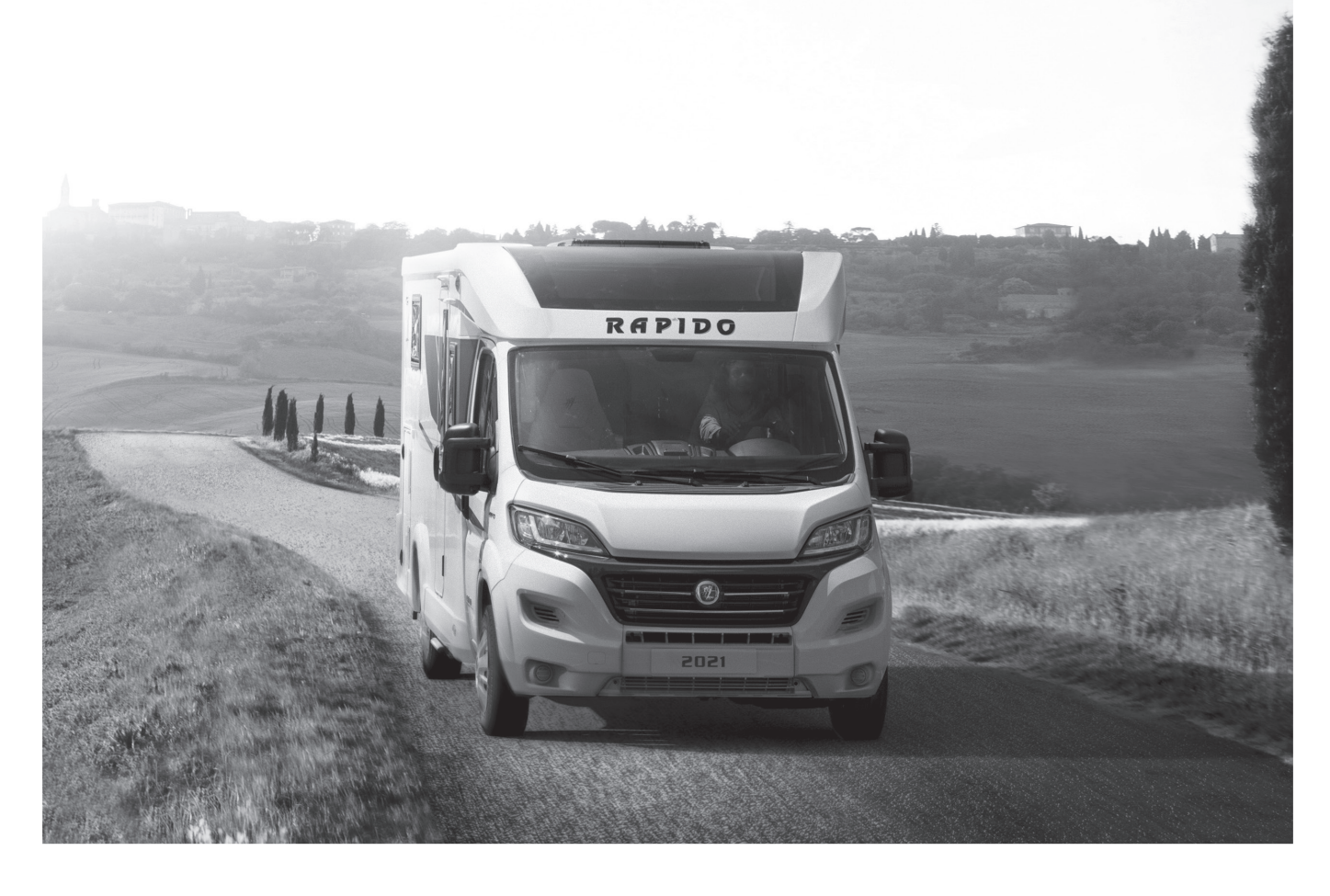
French Charm & Expertise